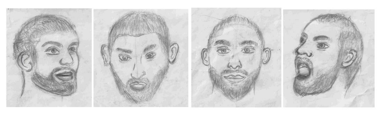
Figure 1. Appearance of James "Frost" Frost character