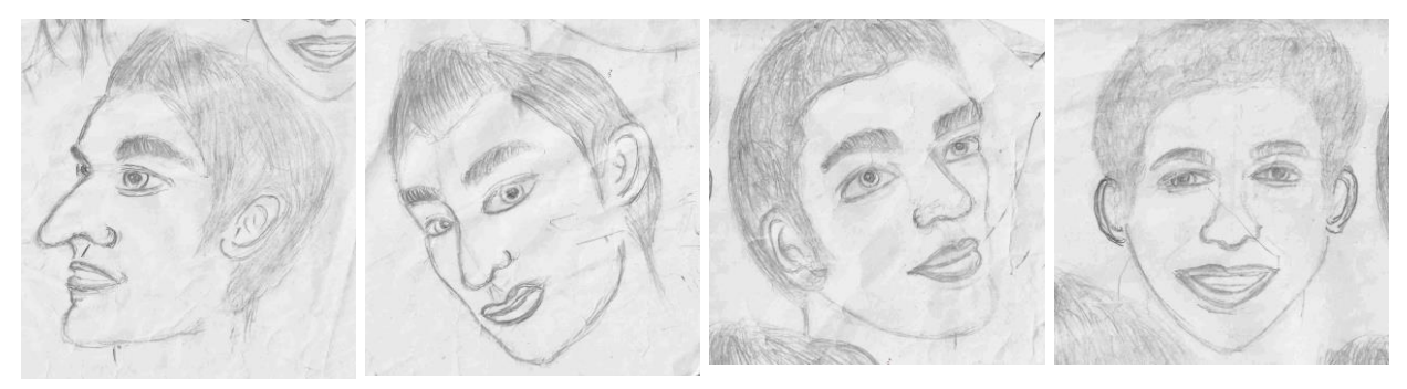
Figure 3. Character appearance Caleb Walker III

The character of Caleb Walker is inspired by many events or phenomena where people who look happy are not necessarily what they show. Caleb is a person who tries to cover all pain and emotions with a happy face.