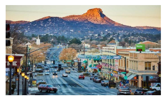
Figure 5. Reference Place Setting (Prescott, Arizona)