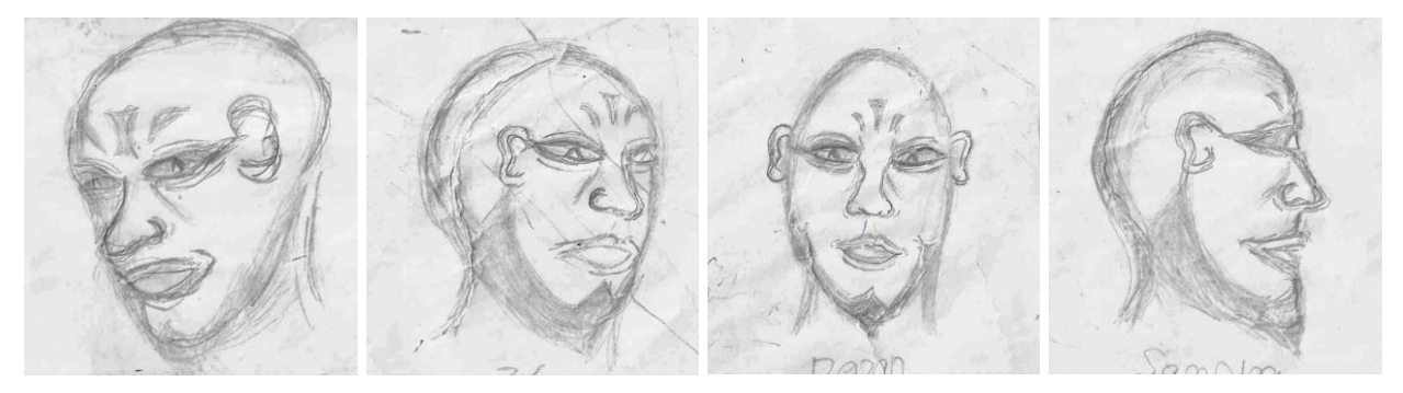
Figure 4. Appearance of Alien Aries character

This character is inspired by the figure of Zartan in the GI Joe series. Where has the ability to blend in and imitate someone's appearance as closely as possible. The original appearance of Aries is to have yellow skin and a bald head.