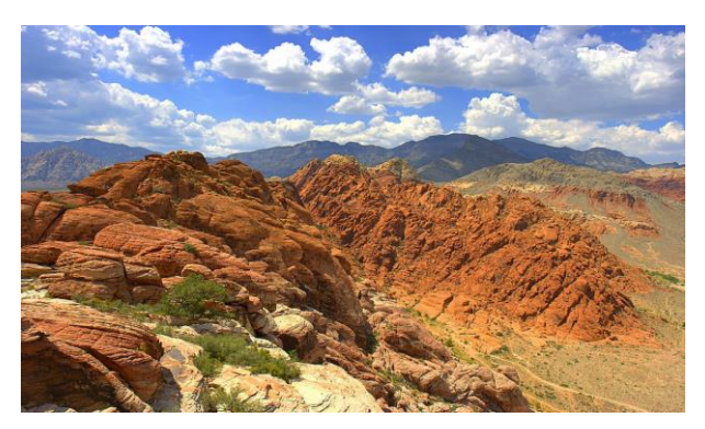
Figure 6. Reference place setting (Navajo Desert, Arizona)