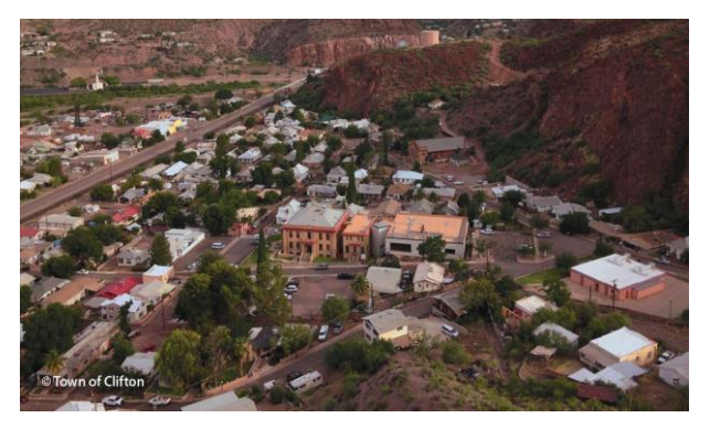
Figure 7. Reference place setting (Clifton, Arizona)