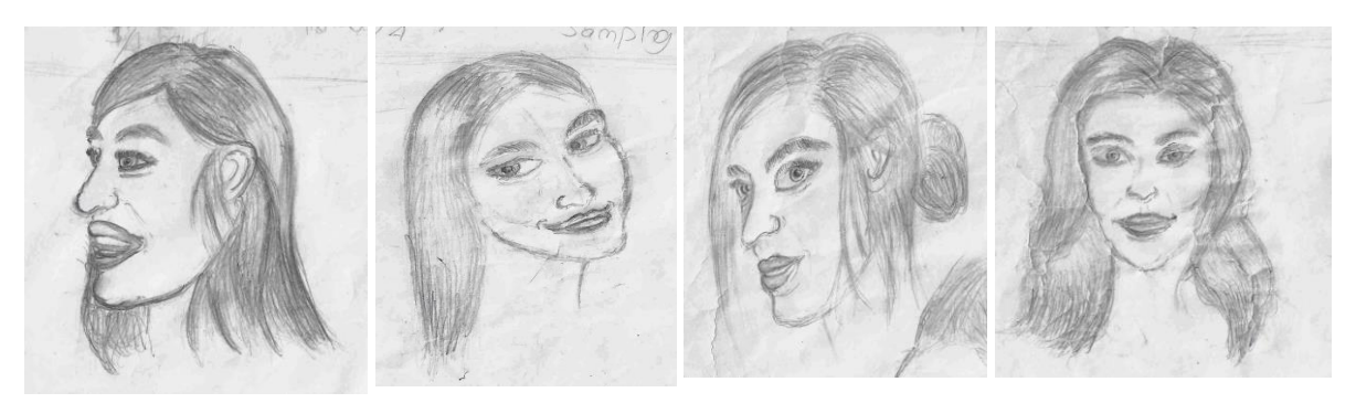
Figure 2. Appearance of Alexandra "Alex" Walker character

Alexandra "Alex" Walker is a companion character from the comic "The Second Shot". Alex is the older sister of Caleb Walker III. As the eldest child and become an adult figure. Alex becomes a strong character and is full of alertness to his surroundings, even to humans. By becoming a figure that balances the nature of his sister who tends to be a bit childish. Alex becomes a figure who will have a big influence on the course of the storyline herself.